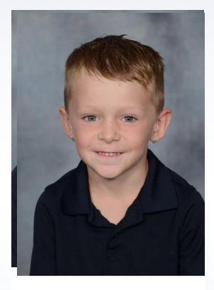
Aston I/2A (Sorry for getting your name wrong last week)