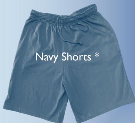
Navy Shorts *

Tights & pants not to be worn underneath