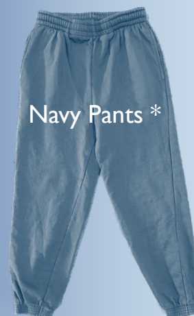
Navy Pants *