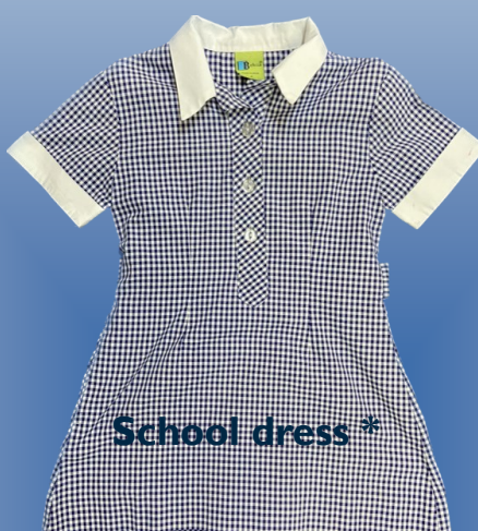
School dress *