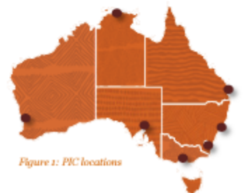
Figure 1: PIC locations

PIC is a national Indigenous consulting business that is majority owned, led and staffed by Indigenous Australians. Staff are located in seven states and territories and have extensive networks with Indigenous organisations reaching into regional and remote Australia. PIC is based on a fundamental believe that real and lasting change happened when it is created by Indigenous people.