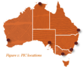
Figure 1: PIC locations

PIC is a national Indigenous consulting business that is majority owned, led and staffed by Indigenous Australians. Staff are located in seven states and territories and have extensive networks with Indigenous organisations reaching into regional and remote Australia. PIC is based on a fundamental believe that real and lasting change happened when it is created by Indigenous people.